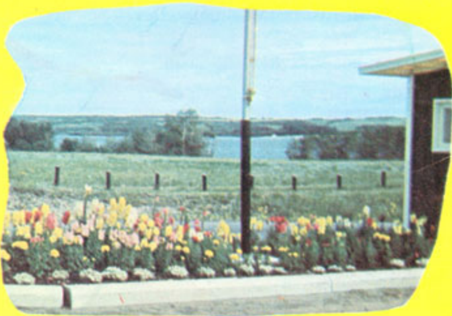
View of Lake Wahtoppanah