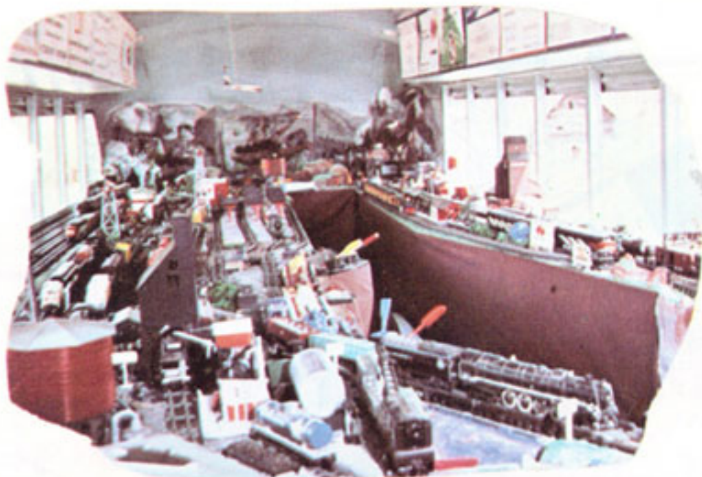
ROADSIDE CANADA — Model Railway. Canadas largest mobile operating "S gauge" model railway may be visited at Rivers. Open May to October.