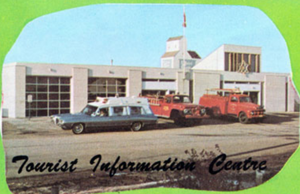
Tourist Information Centre

The new Rivers Ultra-modern Civic Centre housing the Ambulance, Fire Fighting equipment, Library, Agricultural representative Offices, Council Chambers,— Information Booth Fishing Licenses available.