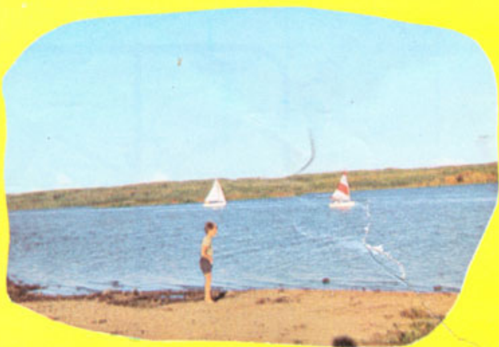
Sailing and Waterskiing are Favorite Pastimes