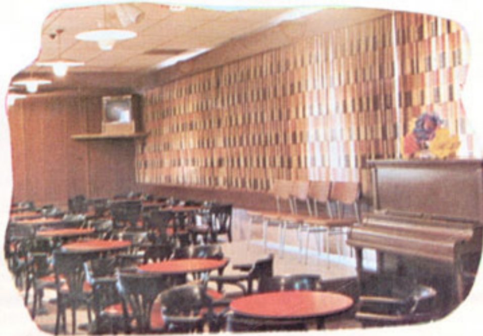
Alexander Hotel, a section of the modern beverage room.