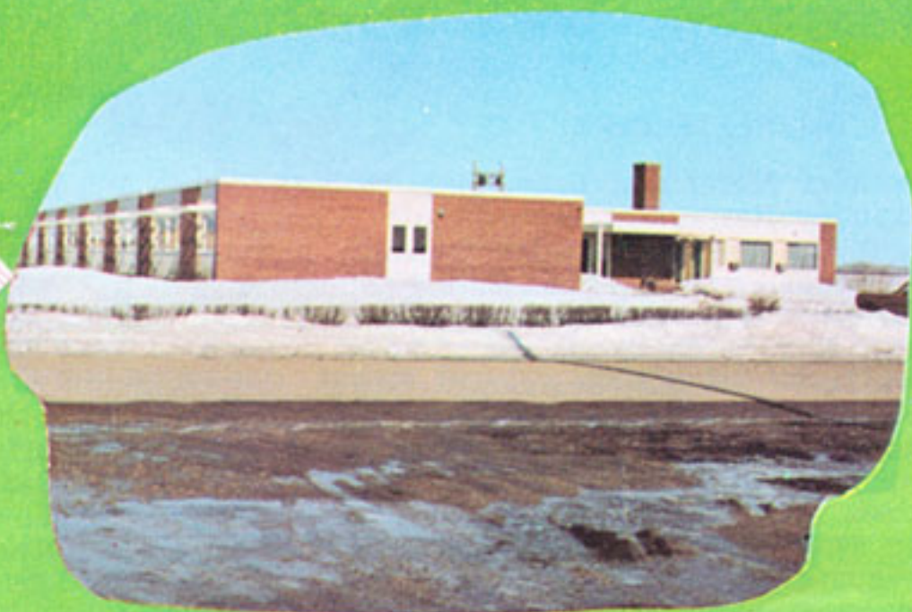
One of Rivers' Elementary Schools.