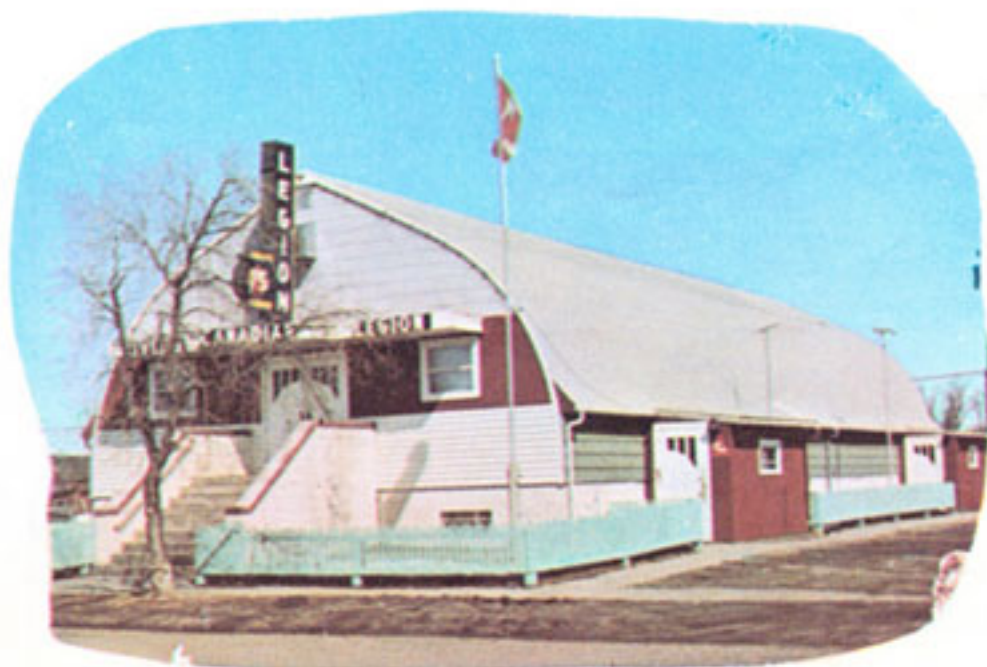
Royal Canadian Legion, Rivers Branch No. 75 with Cocktail Lounge in lower level. Legion Members and visitors welcome.