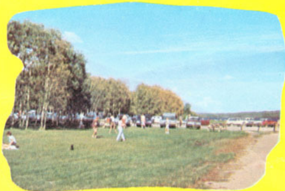
Sandy Beach Area